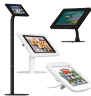
SurferQuest™ Social Center®

Concerned about the cost of supplying a fully managed business center for your guests? Introducing SurferQuest Charge. SurferQuest Charge feature enables administrators to charge for use, thereby creating a considerable revenue flow for your property.