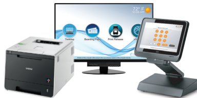
SurferQuest™ Mobile Printing

Introducing the QRconneX Digital Hotel Directory. QRconneX does not require an app download and is designed to showcase your property's amenities via QR Code. Save money, go green, and reduce your printing costs with QRconneX.